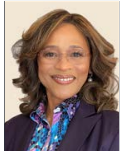
Dean, Scripps Howard School of Journalism and Communications Hampton University

As spring 2022 semester ends, I wish all of you graduating students the best of luck in your future endeavors. Please remember that our school will always be your Home by the Sea. We remain a resource for you and look forward to hearing of your career progress and global exploits. We know you will make us proud. To our continuing students: welcome to the fall semester. We appreciate the opportunity to help guide and support each of you, as you solidify your place in the world.