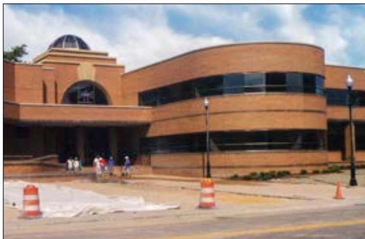
ABOVE LEFT: CONSTRUCTION ON THE CURVED FRONT OF THE SCRIPPS BUILDING SHOWS THE SKELETAL FRAMEWORK. ABOVE RIGHT: THE BUILDING AFTER COMPLETION.