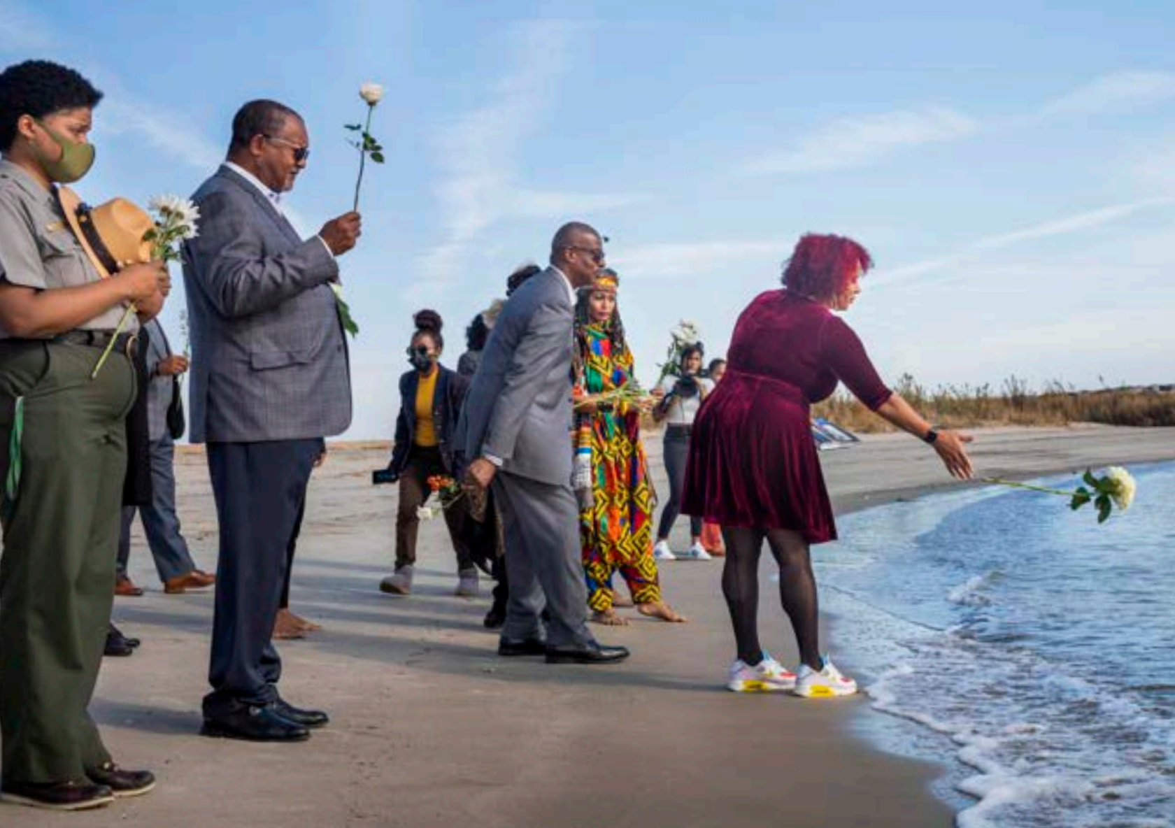
DURING A CEREMONY HONORING ENSLAVED AFRICANS WHO DIED IN TRANSIT, NIKOLE HANNAH-JONES AND OTHER DIGNITARIES TOSS FLOWERS INTO THE WATER AT THE FORT MONROE BEACH.