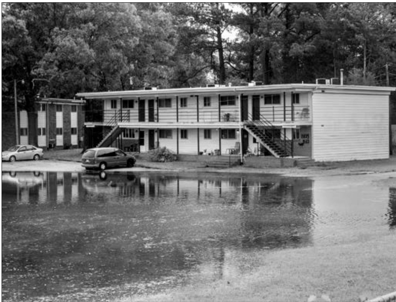
FLOOD WATERS FROM THE POLLUTED PARADISE CREEK IN PORTSMOUTH ALMOST REACH THE APARTMENT DOORS, CAUSING HEALTH CONCERNS FOR RESIDENTS.