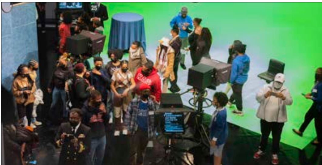
HUNDREDS OF GUESTS TOUR THE TELEVISION STUDIO DURING THIS YEAR'S "HIGH SCHOOL DAY."

This year's "High School Day" attracted thousands of visitors to Hampton University. The Scripps Howard School was featured prominently. Hundreds of guests were able to tour the building, read a broadcast in our television studio, see demonstrations of animation, film-making, and photography. It was the first in-person opportunity for recruitment at the university in three years.